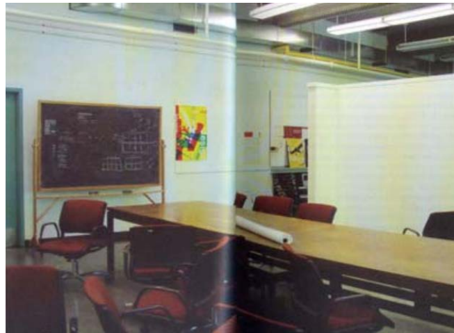
Fig.2 Design Classroom of Washington University

In fact, it is always an important issue to deal with the relationship between “theory and practice” correctly and effectively from the perspective of the mode reform of China's colleges and universities and the practice of professors of art design (interior decoration design)[8]. According to the relationship between theory and practice, the current reform and development of art design in China's higher vocational education can be divided into “theory parallel” and “combination of theory and practice”.